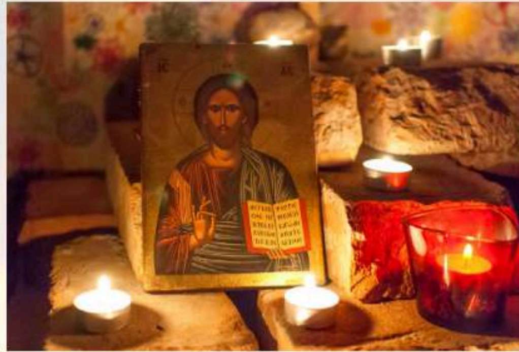
Icon light Jesus

In the week of the 17th of November, the daily prayers remind children that Jesus is always there for us. Inspired by the ' Litany of Trust ', children will remember that trusting Jesus releases us from our worries and helps us to face difficult challenges.