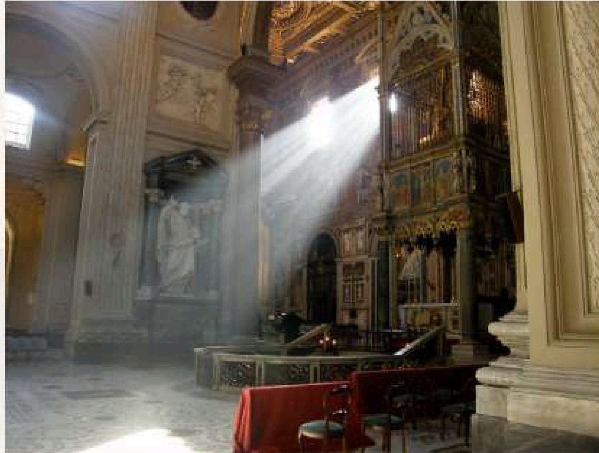
St John Lateran

The assembly for the second week in November highlights the Feast of the Dedication of the Lateran Basilica which holds a special place as the 'mother church' of the universal Catholic Church.